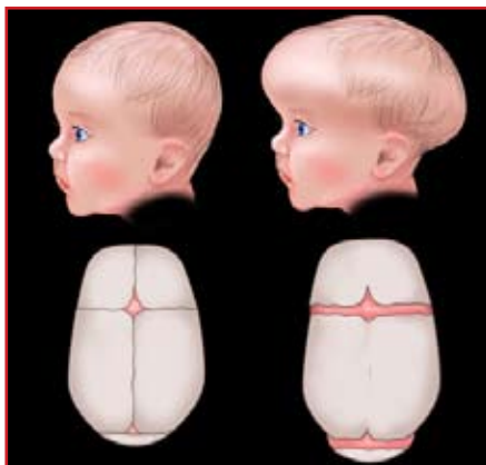
Medical illustrations for educational film production

In 1998, both HOW CHILDREN LEARN and AGING SUCCESSFULLY have won the important CINDY awards for excellence from the Association of Audio Visual Communicators.